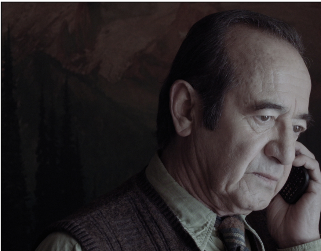
Sergio Hernández as Juan in You'll never be alone

Graduate from the University of Chile in Acting during the year of 1967, early in his career Sergio dabbled in film, theater and television. Being one of the most renowned Chilean film actors, his performances include: "La tierra prometida" (Miguel Littin, 1972), "Diálogo de exiliados" (Raúl Ruiz, 1975), "La Frontera" (Ricardo Larraín, 1991), "Johnny 100 pesos" (Gustavo Graef-Marín, 1993), "La sagrada familia" (Sebastián Lelio, 2006), "Secretos" (Valeria Sarmiento, 2008), "Dawson Isla 10" (Miguel Littin, 2009), entre otras. His latest performances have been Raúl Ruiz's posthumous film "Night across the street" (2012), "No" (Pablo Larraín, 2013, nominated to the Academy Award as best foreign language movie) and "Gloria" (Sebastián Lelio, 2013, Silver Bear award on the 2013 Berlinale). In the field of Theatre it can be highlighted "Fulgur y muerte de Joaquín Murieta" by the Nobel Award Pablo Neruda (1967), "Those who are left on the road" by Isidora Aguirre. Sergio Hernández won the Best Actor Award Altazor 2012. Also, Sergio Hernández was part of the Polish Movement called "Theatre Anthropology" led by Jerzy Grotowski and founded the Wayfarers group that toured Europe and returned to Chile in 1986 presenting "From the darkness, in an act called" at the Trolley Theater, at the heights of Pinochet's dictatorship.