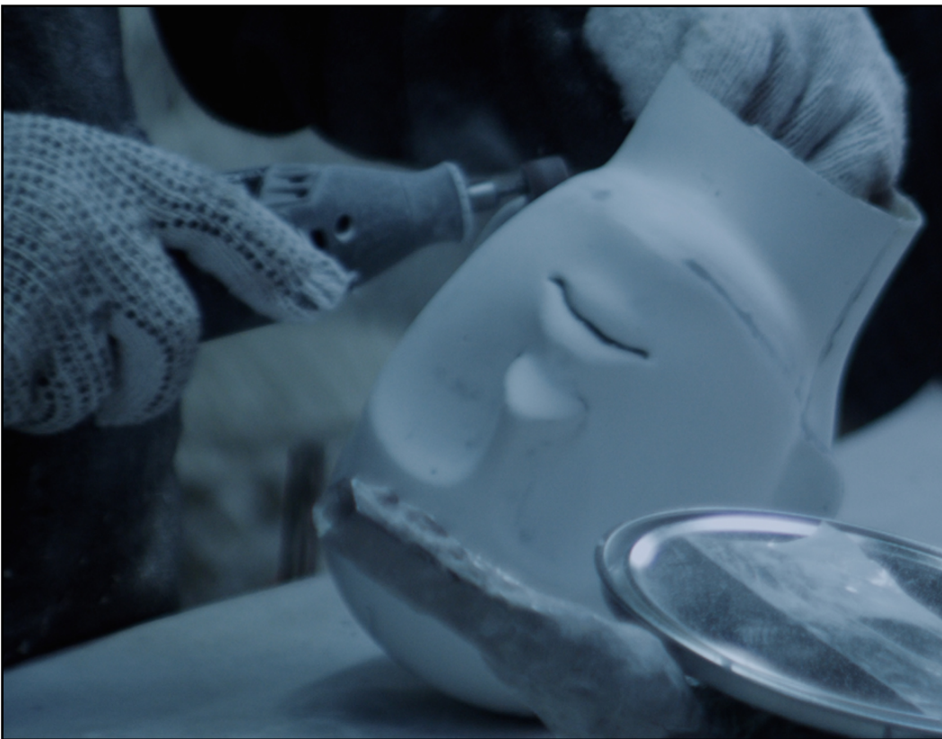
Still from You'll never be alone

“About three years ago, a 20-year-old boy was murdered in Santiago because he was gay. He was tortured for hours: his legs broken, a swastika carved on his stomach using shattered bottles, a piece of his ear torn out. By coincidence, that young boy was a fan of my work as a musician and I knew who he was because we'd spoken a couple of times. I met his family and they urged me to continue “speaking on behalf of boys like him”, not usually represented in the media or even art: in short, a gay and poor kid. This story, however, shifts its focus onto the father of the boy. This is my way of saying: it was not one boy, it's many boys and girls, and women and men. And the life we should examine more carefully is not the boys', it's the rest of us. We who allow this to repeat over and over.”