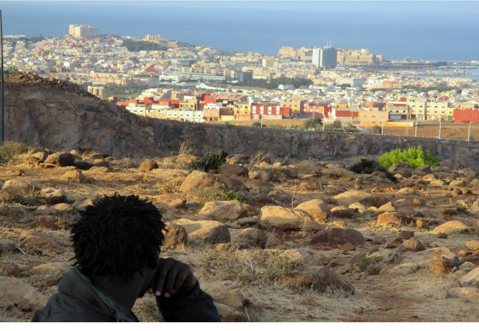
THOSE WHO JUMP, ultimately a film about making a Film, is Abou's portrayal of the human struggle for dignity and freedom on one of the World's most militarized frontiers.